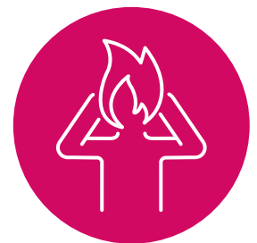
Negative affective state

Nearly one in four doctors write scripts for at least a month's worth of opioids